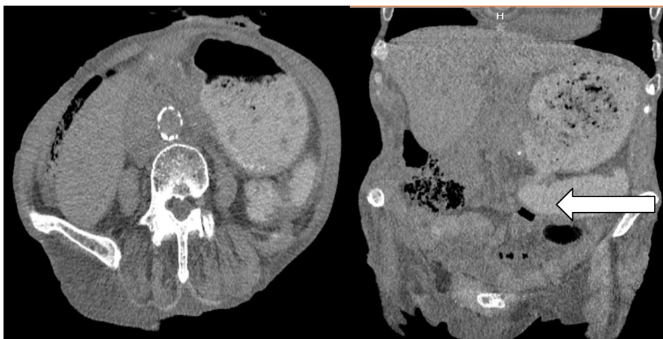
Fig 4. White arrow: finding by tomography of fistula location with passage of the contrast medium towards the colon